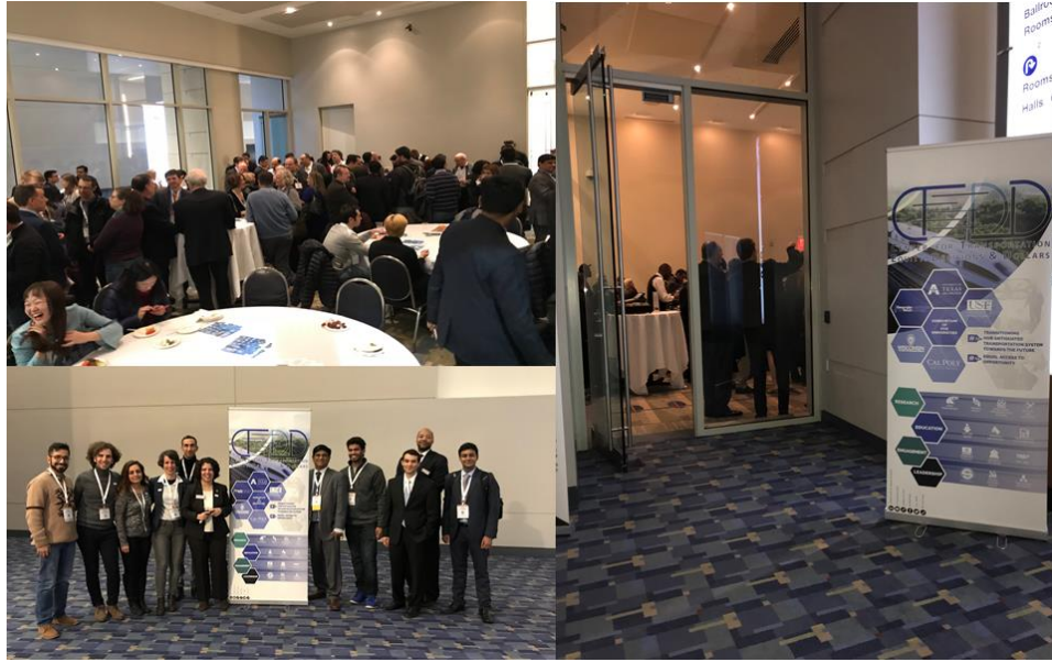
Fig. 1.2: CTEDD and CUTR cohosted a reception event at the 97 th annual TRB meeting.